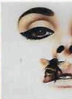
Lana Del Rey Fan Art

If you are using collaged images the work submitted must include substantial changes to the original work. Changing the medium or adjusting color does not transform the original source material.