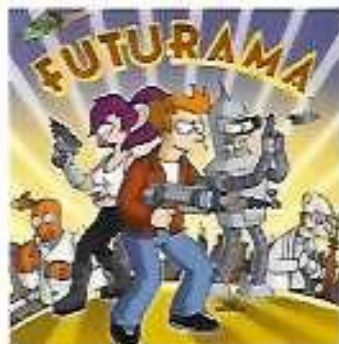
Futurama, Comedy Central