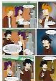
Futurama Fan Art