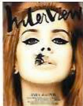
Lana Del Rey, Interview Magazine