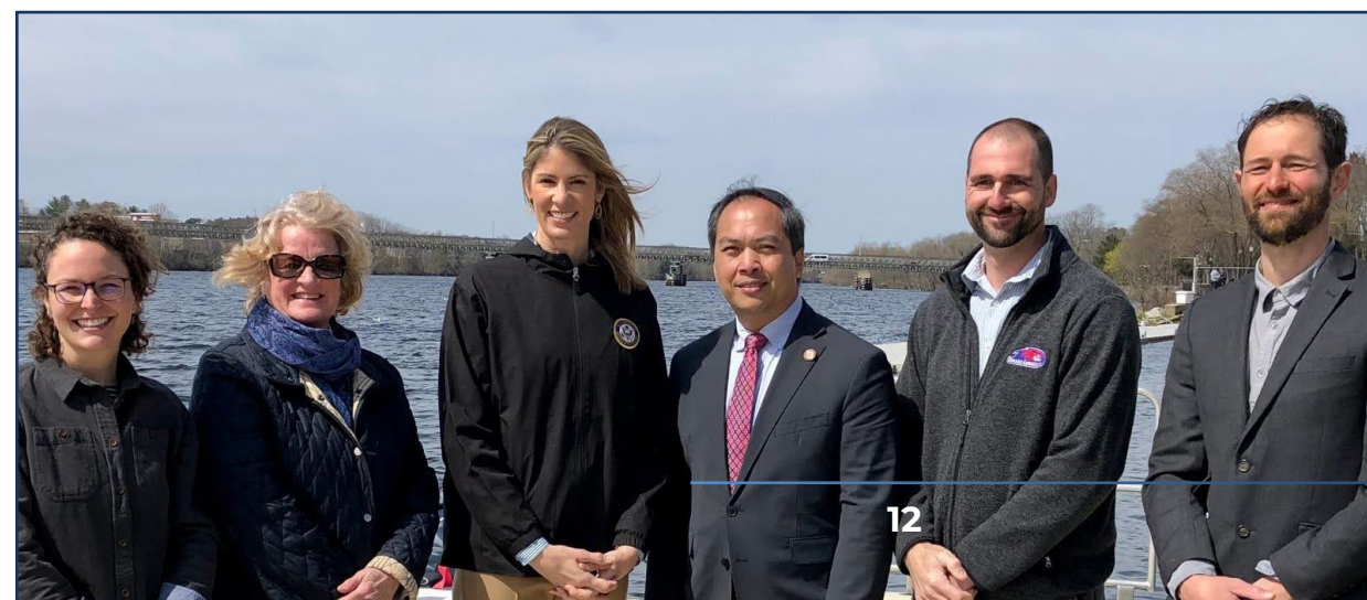
Lori joins local leaders at the Merrimack River to celebrate securing $350,000 in federal community project funding for the Merrimack River Watershed Council.

In the Third District, PFAS contaminations have impacted at least 16 cities and towns. This Congress, I secured federal funding for Hudson and Littleton's water treatment plants that will filter PFAS chemicals and ensure families are drinking clean water.