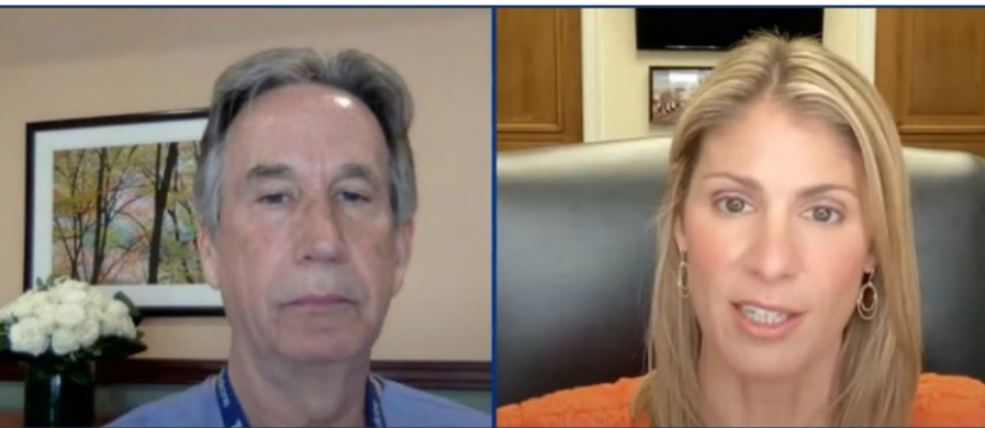
Lori hosts a Facebook live with Dr. James Baker after the House passed her Medication Access and Training Expansion (MATE) Act, legislation that addresses the root causes of the addiction crisis.

From day one in Congress, I've worked with anyone – Democrat or Republican – who is willing to take action to address the addiction crisis. As a member of the Bipartisan Addiction and Mental Health Task Force, I work with my colleagues to identify and advance meaningful solutions and enact policies to address substance use disorder and addiction, improve access to mental health care, and prevent overdose deaths.